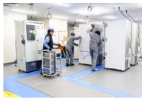
3rd–4th Floors, “Brain and Life” Innovation Hub (BIH)

ChBRI センター Center for Human Brain Resource Initiative